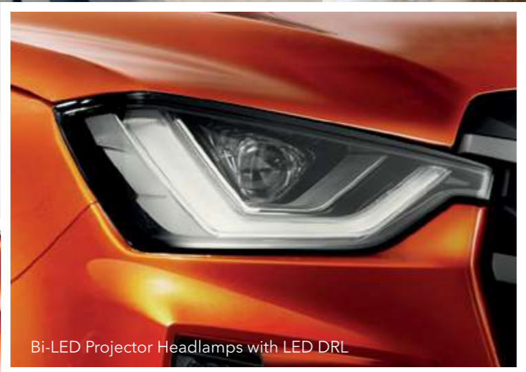
Bi-LED Projector Headlamps with LED DRL