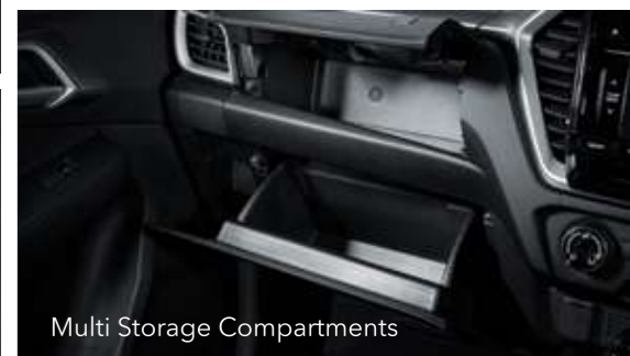
Multi Storage Compartments