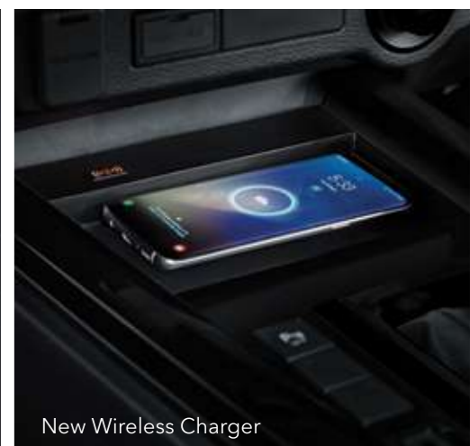
New Wireless Charger