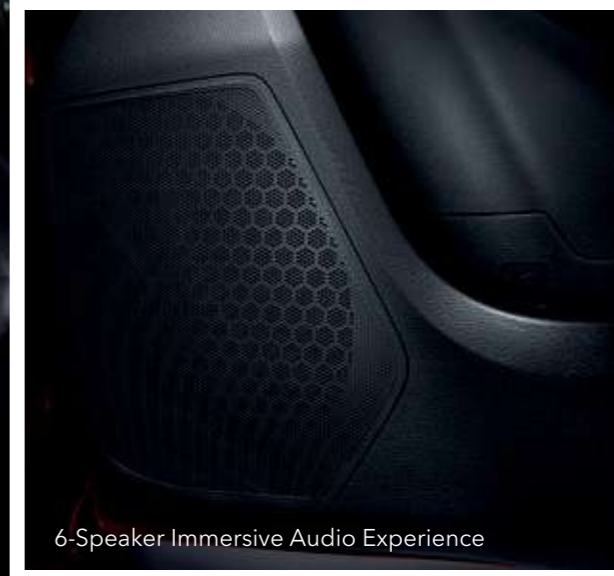
6-Speaker Immersive Audio Experience