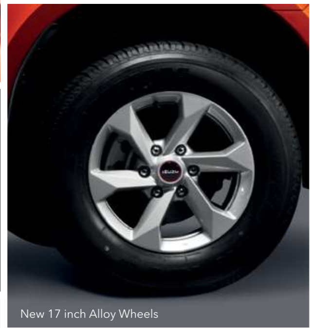
New 17 inch Alloy Wheels