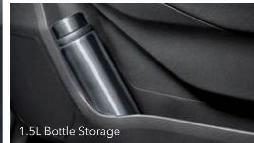
1.5L Bottle Storage

The New Isuzu D-Max Auto Plus interior greets you with New Fabric Seats Design, ample space, and practical functionality, allowing you to relax and enjoy your journeys in comfort.