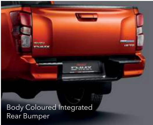
Body Coloured Integrated Rear Bumper