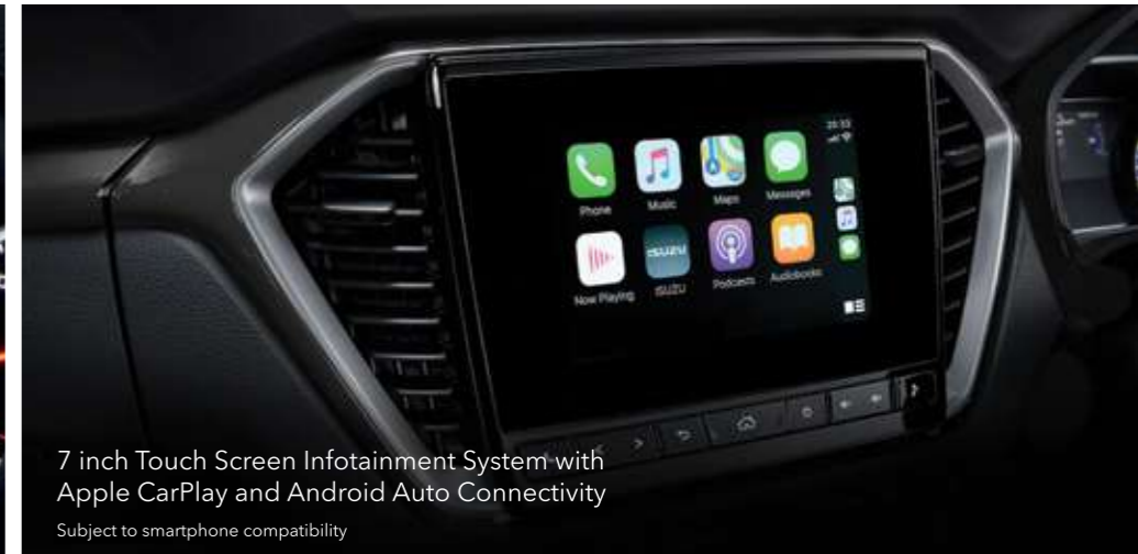
7 inch Touch Screen Infotainment System with Apple CarPlay and Android Auto Connectivity Subject to smartphone compatibility