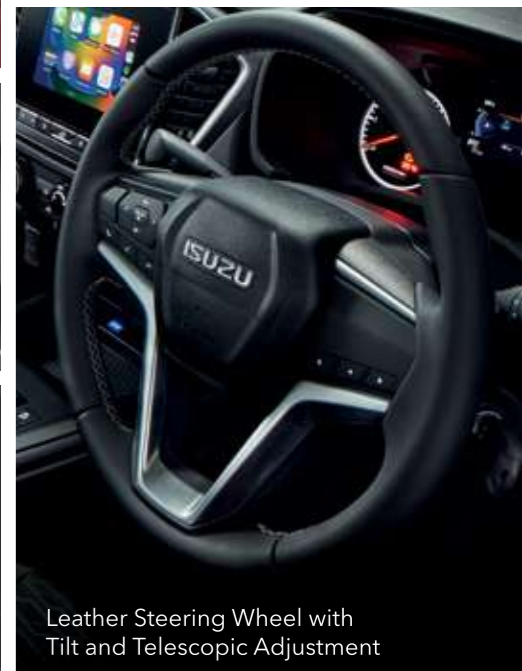
Leather Steering Wheel with Tilt and Telescopic Adjustment