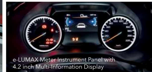
e-LUMAX Meter Instrument Panel with 4.2 inch Multi-Information Display