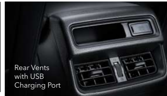
Rear Vents with USB Charging Port