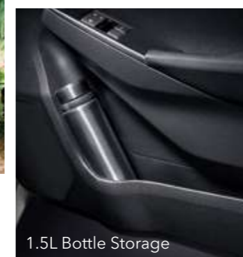
1.5L Bottle Storage