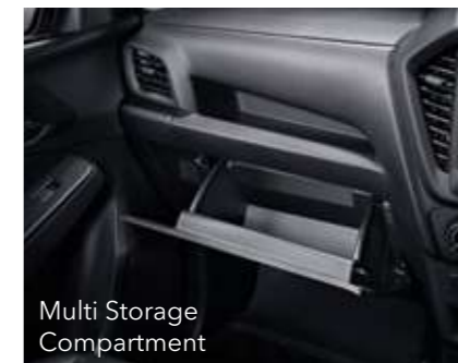
Multi Storage Compartment

The New Isuzu D-Max is built to last. With a new bold design, strong performance, a practical and comfortable interior - it is perfect for everything you set out to do.