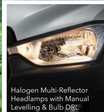
Halogen Multi-Reflector Headlamps with Manual Levelling & Bulb DRL