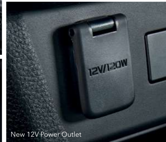
New 12V Power Outlet