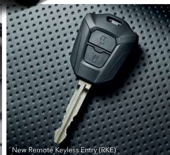
New Remote Keyless Entry (RKE)