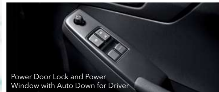
Power Door Lock and Power Window with Auto Down for Driver