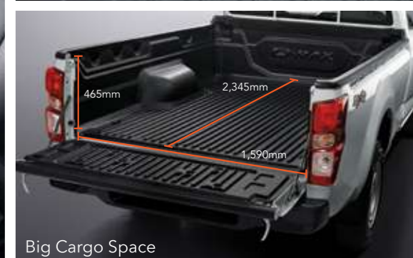
Big Cargo Space